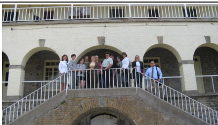
"Team NSCC" and EduNova partners in St. Lucia.